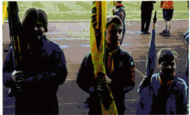
St George's Day Parade 2009

St George's Day Parade was held at the Aldershot stadium and had a new theme this year, all had a good time and enjoyed it, shame about the sound we could not hear most of it but had a great turn out from all the lads and lasses. So you can all pat yourselves on the back and be proud of what you have achieved.