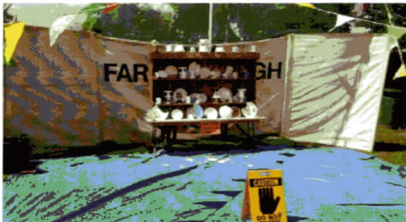
Fundraising at a Football tournament