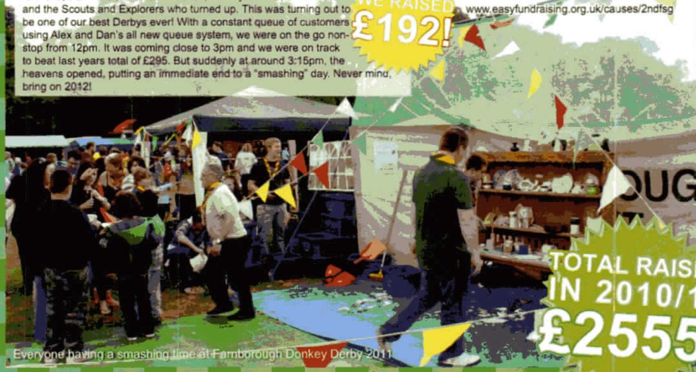
Everyone having a smashing time at Farnborough Donkey Derby 2011

www.easyfundraising.org.uk/causes/2ndfsg